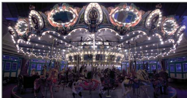
Carousel, Glen Echo Park, Glen Echo, Md. USA