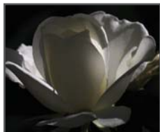
31.07.09-25.10.09 Out of camera