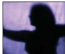
30.10.09-Jan 2010 Unveiled