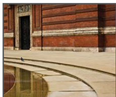
End 25.01.09 Round every corner

You are invited to the private views which take place on the first Saturday of each exhibition 12 noon – 3pm